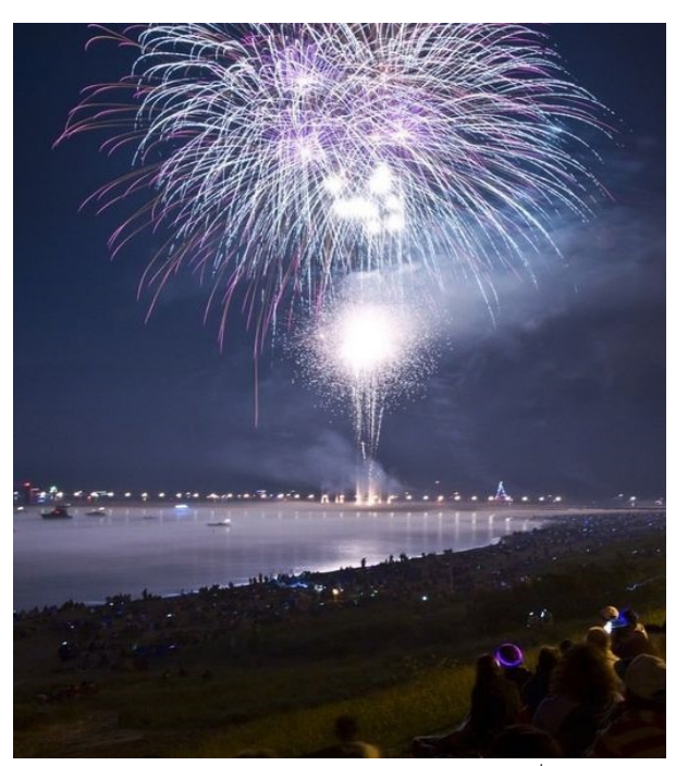
Light Up The Lake occurs every July 3rd

If you arrive in the Kalamazoo/Battle Creek airport (AZO), you should take I-94 west, then US-131 north, and then MI-43 west. Get off on US-196 north, then you can take Water Street all the way to South Beach, the most popular beach in South Haven.