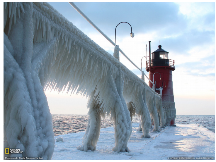
The ice-crusted lighthouse

Don't want to wait until summer? You're in luck, South Haven is a sight to see in the middle of winter, with it's sparkling landscape, tubing, crosscountry skiing, snowmobiling, ice skating, and even speed skiing at one of the area ski resorts.