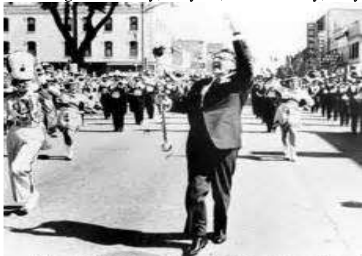
Meredith Willson led a 75 Trombone Band at the North Iowa Band Festival in 1962.

The North Iowa Band Festival is marking 77 years the event has been held. It offers free music, entertainment, a carnival and many different types of events and food. It is being held Friday, May 22, 2015-Sunday, May 24, 2015 in East Park.