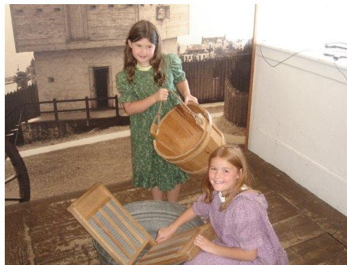
Playing at Fort Mackinac

Michilimackinac, the buildings moved across However, that building current structure.