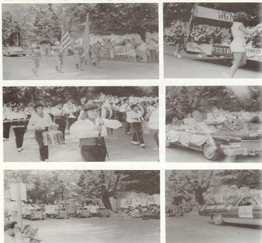
4th of July Parade

Lebanon is also the home of the Boone county Fourth of July parade, which is always a big hit for everyone.